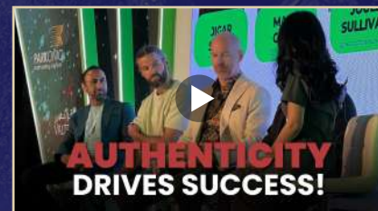
The Key Ingredient for Business Success