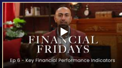
Financial Fridays Episode 6: Key Financial Performance Indicators