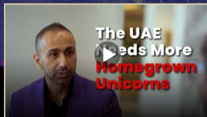
Why does the UAE need more homegrown unicorns?